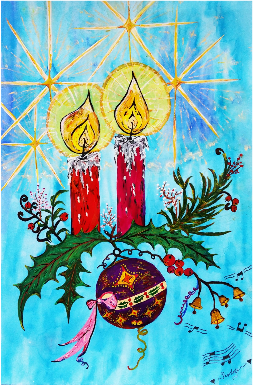
Watercolor painting Christmas Card (November 2014)