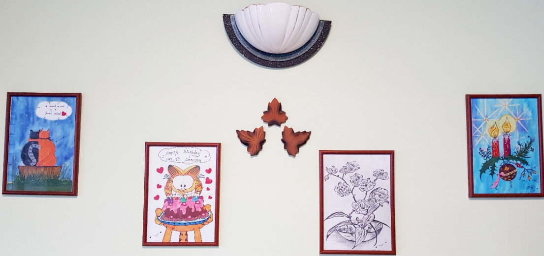
Art gallery on a wall (December 2016)

May the name of Yahweh God be praised! Amen.