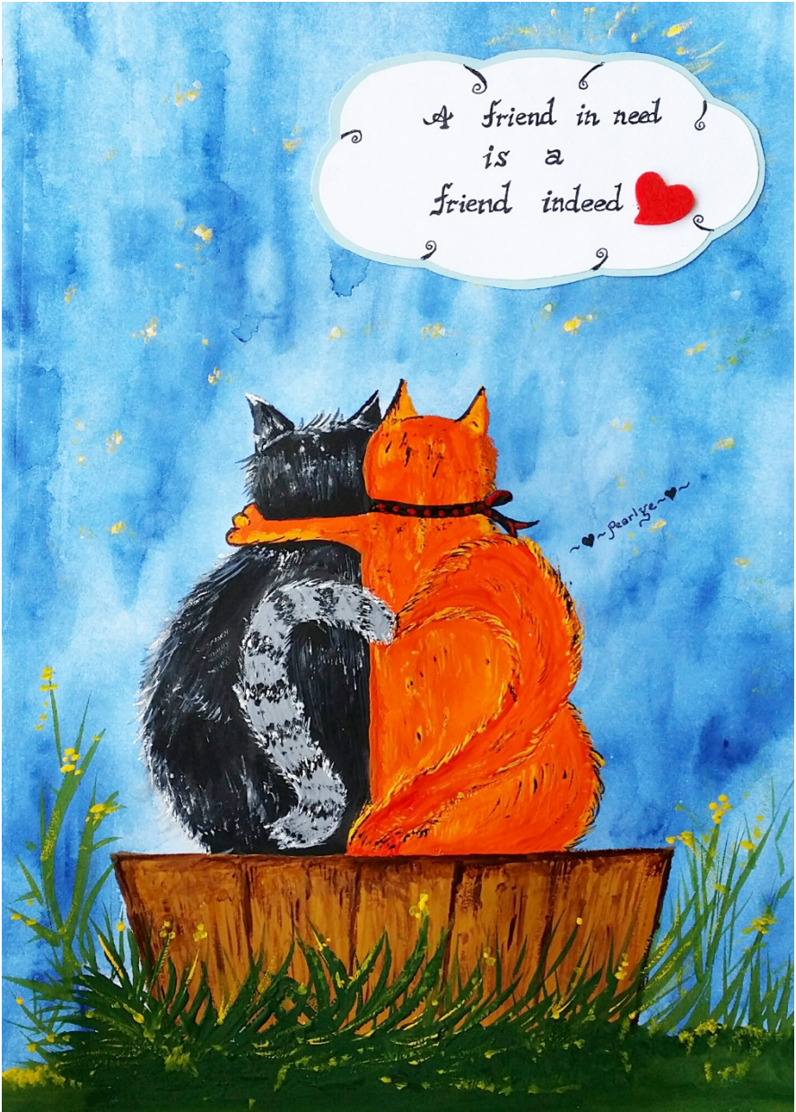
A Friend in Need (September 2014)